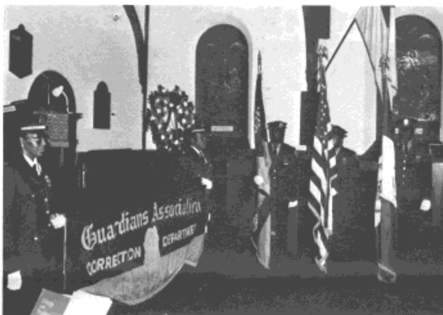
THE HONOR GUARD STOOD TALL throughout the memorial service, a moving event to honor captains we have lost.