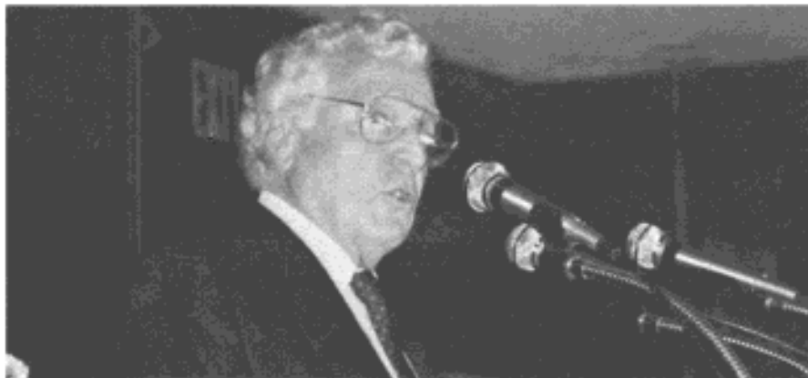
MARIO BIAGGI ADDRESSED HIS MANY OLD FRIENDS and supporters at the dinner dance.