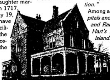
The Penitentiary on Blackwell's Island.