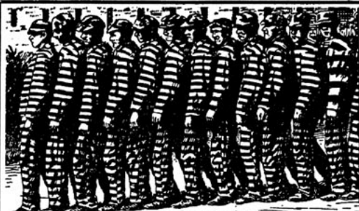
DOC's first report in 1896 City Record detailed inmate count.

DEPARTMENT OF CORRECTION, COMMISSIONER'S OFFICE, 66 THIRD AVENUE, NEW YORK, May 2, 1896.