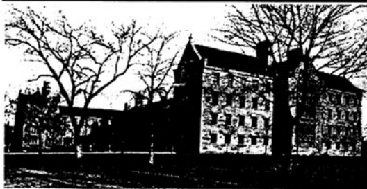
The Workhouse on Blackwell's Island.

Further sections of the chapter provided for the eventual realignment of island properties so that Blackwell's island would become, in effect, more Charities Department territory while Rikers and Hart's islands would become more Correction Department territory.