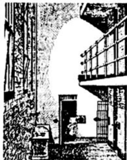
Female inmates' tiers.

In 1902 a massive, gray building replaced the Tombs but its chateau-like appearance could not displace in common parlance the name of the original structure whose architectural style had been based on a steel engraving of an Egyptian tomb. Seven decades later that replacement was itself replaced by the present Manhattan Detention Complex but still "The Tombs" name persists.