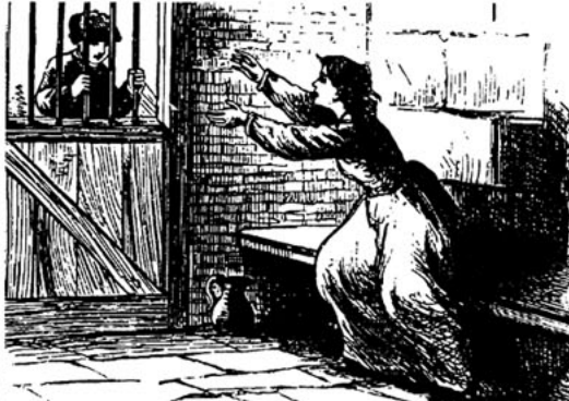
The Women's Prison was serviced by the Sisters of Charity.

with four tiers of cells. The bottom tier opened upon the main floor and each of the three above it opened upon its own iron gallery, one above the other. Two officers -- in those days, called Keepers -- were posted on duty in each gallery to guard the prisoners.