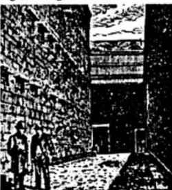
Tombs gallows yard.

The male prison contained a high-celled but narrow hall