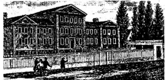
Some Tombs granite came from old Bridewell in City Hall Park, a pre-Revolutionary prison torn down in 1838.

The Boys' Prison was also located in the Centre street side. The Women's and Boys' Prisons were serviced by the Sisters of Charity seeking to minister to the inmates' spiritual wants. One room of the prison was fitted up as a chapel and religious services regularly held in it. The week was divided among various religious