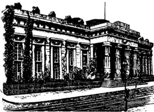
The Halls of Justice aka "The Tombs."

gular shape, 253 feet long by 200 feet deep, it appeared from the street only one story in height, the long windows showing just a few feet above the ground and extending nearly to the cornice. The main entrance, on Centre street, was reached by a broad flight of dark stone steps that led to a big and forbidding portico, supported by four huge Egyptian-like columns. The other three sides featured projecting entrances and columns.