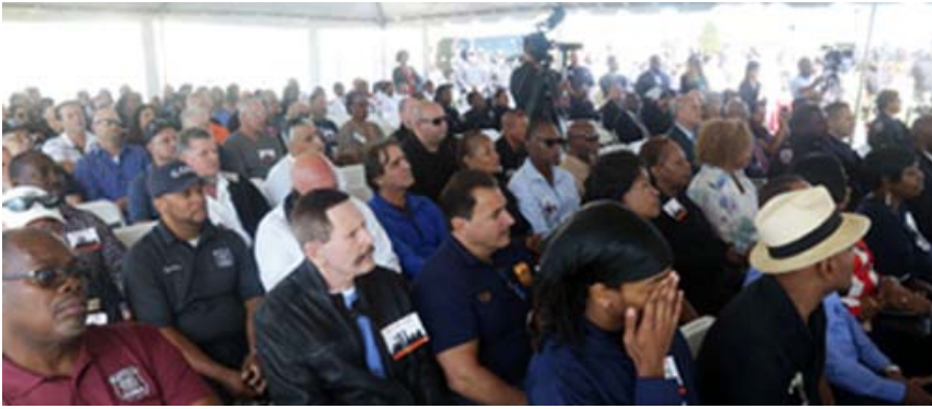
Above image is one of 8 selected by the webmaster from several made available by DOC OPI.

So today, it is with great reverence, honor, and privilege to be able to pay tribute to you all with the dedication of this 9/11 monument.