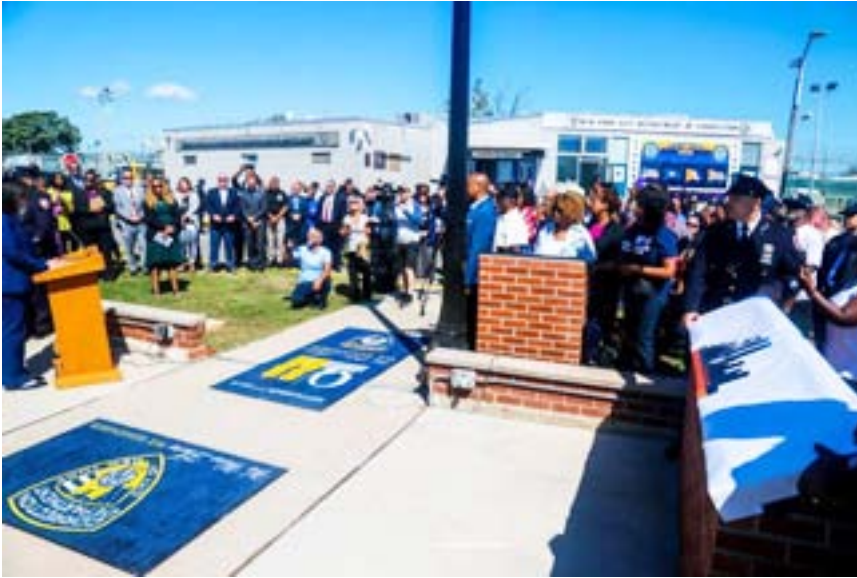
Above image is one of 8 picked by the webmaster from several OPI made available.

May we pause and take time to accept the blessings of this sacred ground and our sacred bond.