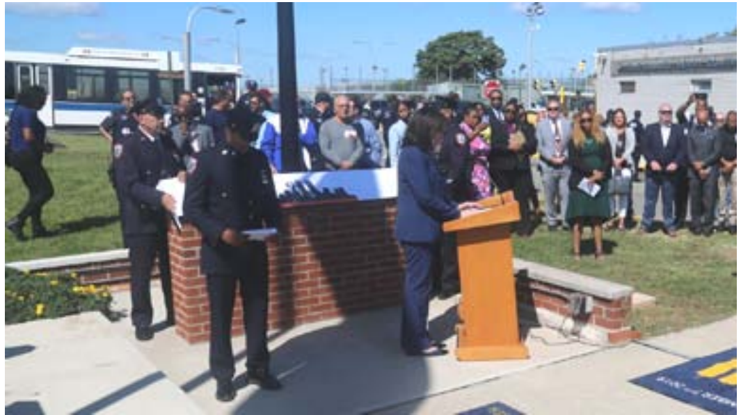
Above image is one of 8 picked by the webmaster from several OPI made available'

Having gathered here, to honor, and pay tribute to the heroes that selflessly responded on September 11th – those who made great personal sacrifices in the search, rescue and recovery effort, as well as