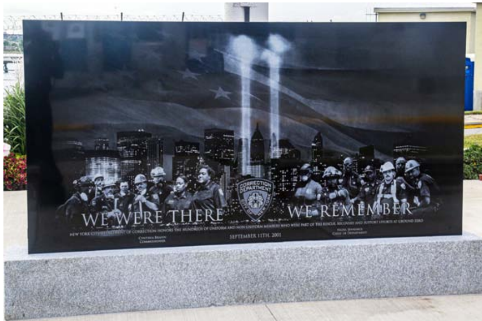
Above image is one of 8 picked by the webmaster from several OPI made available.