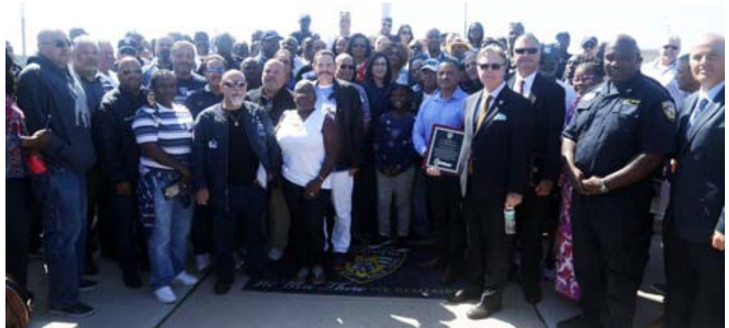
Above image is one of 8 picked by the webmaster from several OPI made available.

Without hesitation, you stepped forward to serve during those incredibly challenging times and this monument will serve as a constant reminder of the sacrifices you made.