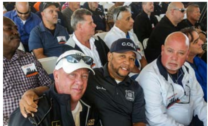
Above image is one of 8 selected by the webmaster from several made available by DOC OPI.

As your Commissioner, several years ago I set out to ensure that the history of the women and men at DOC who assisted in the rescue, recovery and support efforts after September 11th was known. And recognized.