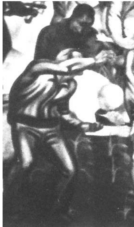
Scaffold on the left in the 1961 sepia 8x10 photo hides from view details visible in the much earlier b&w 5x8 photo.