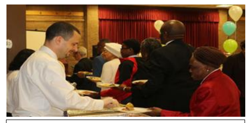
Service with a smile to Boldest Volunteers at Appreciation Celebration.