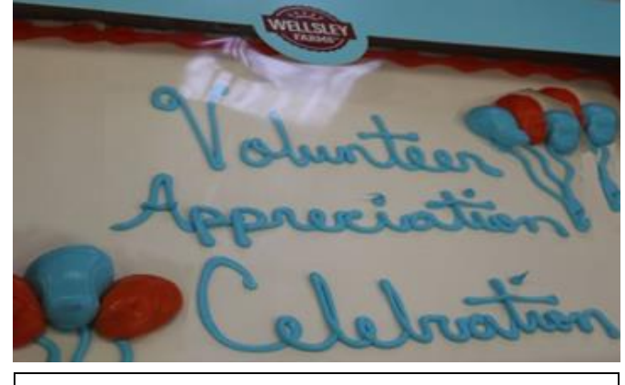
The icing on the cake tells the story of the event.

The Independent Commission on New York City Criminal Justice and Incarceration Reform noted on pages 63-64 of its 147-page report: