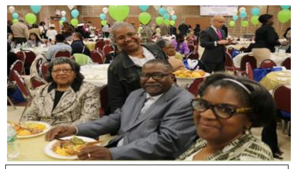
Boldest Volunteers' smiles at their Appreciation Celebration tables

This website's random sampling from about 200 faith-based and general volunteer groups, community partners and service providers appearing on a 2019 NYC DOC list of such entities currently working or having worked in the recent past with the agency: