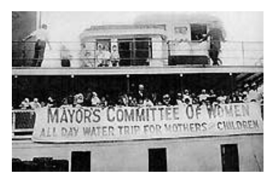
"All day water trip for mothers and children" reads the banner of the "Mayor's Committee of Women" displayed

"The all-day water trips were planned to give a happy day to mothers and children from the congested districts of the City. On these excursions were tired and anemic mothers, cardiac, crippled, and kindergarten children.