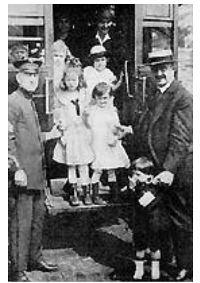
Children are assisted off a bus for escort to their excursion aboard the steamer Correction

"The boat carried its full quota only, 800 persons. There was no overloading, and wire netting was placed outside the rails of the steamer as an effective safeguard for the children. Strict discipline prevailed and fire and boat drills were in order. Usually two firemen and two policemen were on board and, as a result of fine management and efficient care, no one was hurt.