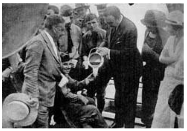
Officials wait on wounded soldiers on board Correction.

"Requisition was made of the Correction to carry City officials, honored guests and relatives and friends of soldiers expected on incoming ships down to Quarantine, or thereabouts. The