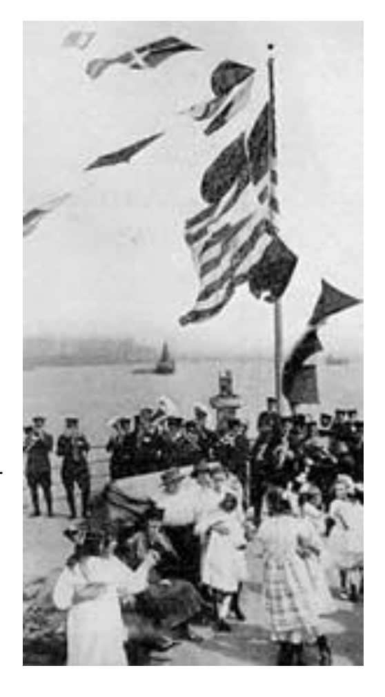
Children dance, a band plays, flags flap in the breeze, as the steamer Correction plows New York waters on a WWI era excursion.

The latter three were named for two former Commissioners and the then current one. The annual report declared: