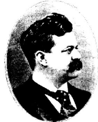
Robert A. Van Wyck First Greater NY Mayor

Rudolph W. Giuliani RUDOLPH W. GIULIANI MAYOR