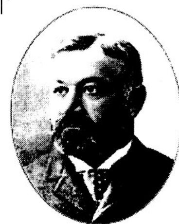
Richard Croker Tammany Hall Leader

Among Mayor Strong's most important appointments was naming Theodore Roosevelt as Police Commissioner. Former Assemblyman Roosevelt, who served as U.S. Civil Service commissioner in President Harrison's administration, promoted the merit system approach within the Police Department as Commissioner.