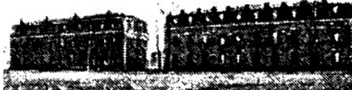
Blackwell's Island inmate workshops