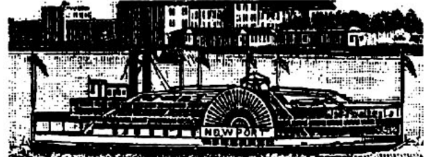
Steamboats ferried Blackwell's inmates.

The Blackwell's Workhouse was built in 1852 to replace a century-old similar facility at Bellevue. Containing