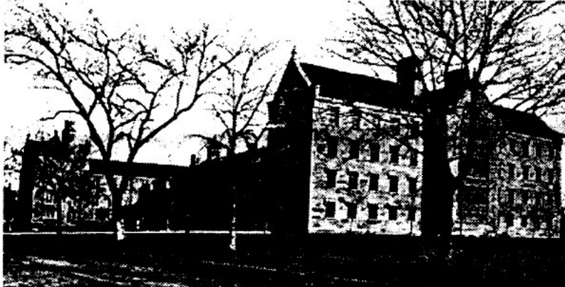
The Workhouse on Blackwell's Island.

221 cells arranged in tiers along the three-story walls of granite, the building functioned as an institution for punishment of petty violators, many of whom were classified as habitual "drunks and disorderlies," including several who virtually became permanent residents even though the usual stays were counted in days. Most workhouse inmates were assigned work either in the workhouse shops or at other city institutions. However, the DOC-creation law of 1895 specifically declared that workhouse inmates may work on Public Charities grounds and buildings, under the "oversight and direction of keepers, but no inmate of the workhouse shall be employed in any ward of any hospital."