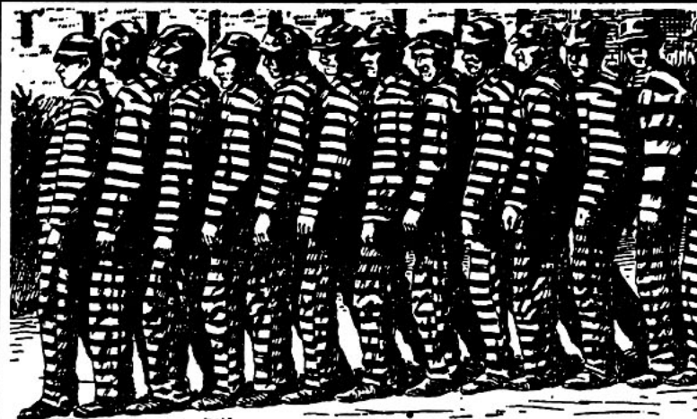
DOC's first report in 1896 City Record detailed inmate count.

DEPARTMENT OF CORRECTION, COMMISSIONER'S OFFICE, 66 THIRD AVENUE, NEW YORK, March 10, 1896.