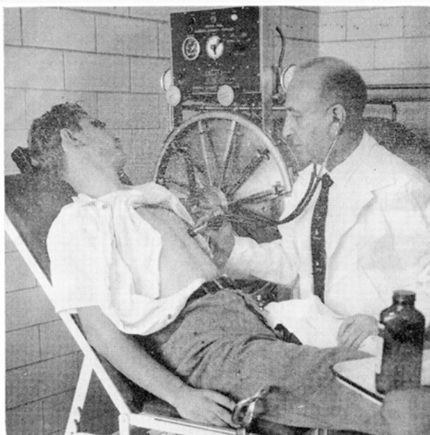
If an inmate needs medical care it is provided in the new detention facility's completely equipped modern medical clinic