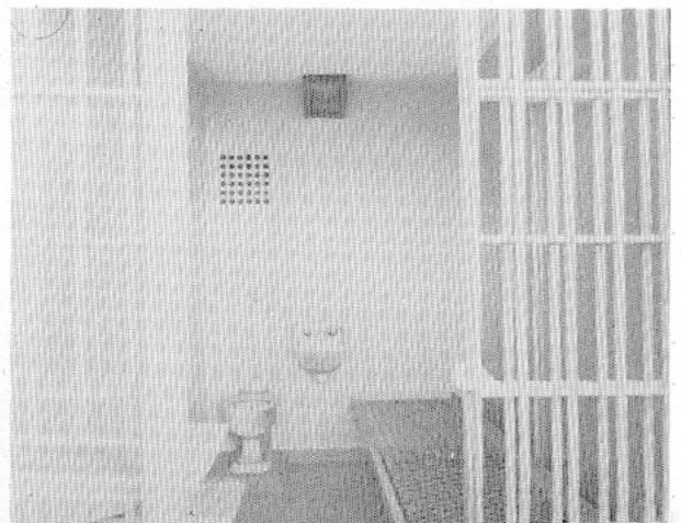
The measurements of a typical cell in the new Brooklyn House of Detention for Men are 5 ft. 8 in. wide by 7 ft. 10 in. deep and 7 ft. 11 in. high on the flats (8 ft. 5 in. on the mezzanine section).

The reception section adjoins the administrative offices since the functions of both are closely inter-related. This section is located on the first floor and faces the prison yard. Prisoners received from the Central Courts Building and from the various courts scattered throughout the borough will be processed in the receiving room. It contains four (4) pens for the reception of adult inmates and two (2) separate ones for the adolescents. These units include showers, clothes box, medical examination room, inspectoscope, administrative and fingerprinting desks for